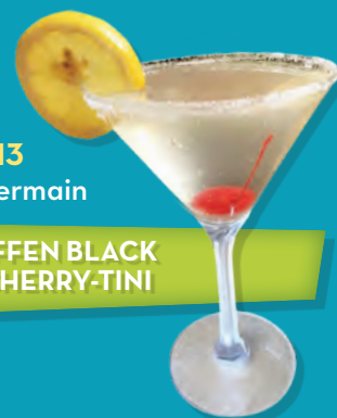
EFFEN BLACK CHERRY-TINI

Stoli Crushed Mango Vodka, peach schnapps and pineapple juice.